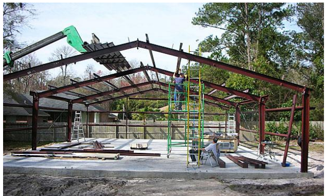
This is similar to the proposed multipurpose building

concrete floor, no heat or air conditioning will be needed in this building. This all steel building (which is termite proof) would be open on all sides with no bedrooms, toilets, or security bars. This is a quote from a bona fide Costa Rican contractor who is a Christian and has done good work here before. As he puts it, “I will build this structure for you with love.”