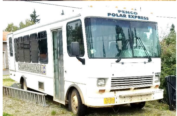
Newly donated bus in Fairbanks, AK

A church in Alaska just gave me another 30-passenger bus that's in really good shape. I am checking to learn if shipping it here and the duty dollars required to do this would be prohibitive. Right now, the property, "horse barn church," "Rocky the bus," the 125cc Suzuki motorcycle, the 2002 Suburban, the fellowship hall, the hospitality cabins, the new school building—the entire place--is debt free.