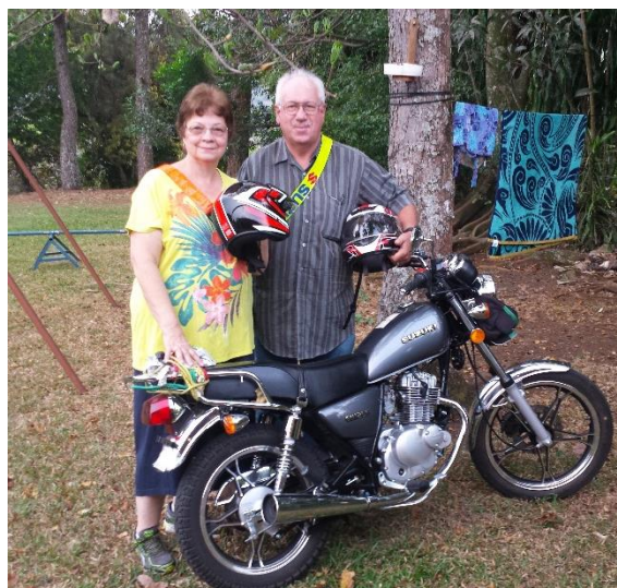
The Todee pastor will get a motorcycle like this.

PS Remember this $2,400 is paid in full for the land with a deed and the motorcycle and a title with helmet. Thank you for helping together with us for these dear African people in prayer and giving.