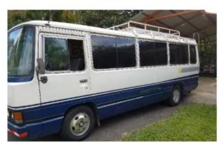
"Rocky" the bus needs two qualified drivers from the church.