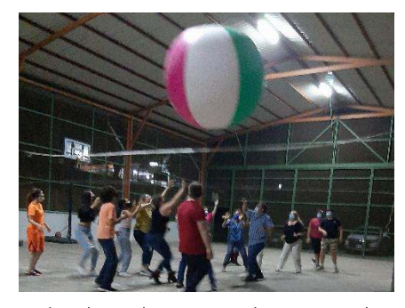
Church youth activity in the vocational school building