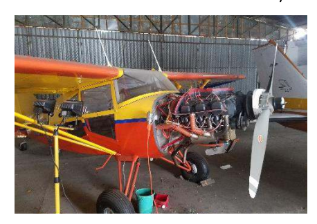
Annual Inspection on airplane