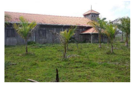
Former Catholic church at the ranch in Moravia de Chirripó .

A work team from Indiana came recently and helped with maintenance on the property and the church. One thing they did was paint the metal roof on the church. They conducted a VBS for the children. They also brought me from the United States a master cylinder for the 2002 Suburban as well as a few other needful parts. I owe many of you a handwritten thankyou note, but the mail here is unreliable. Your gifts are all noted, and the Lord knows all about what we are doing together.