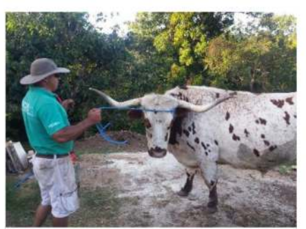
Our neighbor's pet longhorn used to pull his oxcart in parades

CENTRAL MISSIONARY CLEARINGHOE, P.O. Box 219228 - Houston, Texas 77218-9228 1-800-CMC-PRAY Sending Church: Lavon Drive Baptist Church, 1520 Lavon Drive, Garland, TX 75040