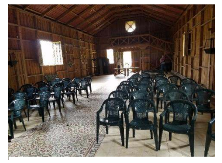
Church now used for Cabecar ministry